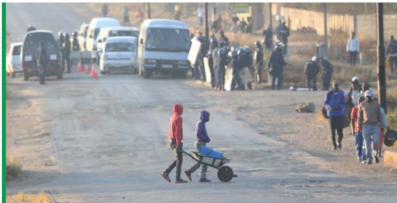
Armed Anti-riot Police searching vehicles in January

There were disturbances to the transport ferrying children to school, and some students were left stranded. Some roads were closed and busses were unable to proceed. In some areas, children were among the adults who were ordered to disembark from public transport and to terminate their trips.