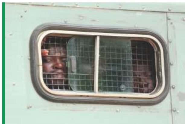
January 2019 arrested protestors being transported to court

In almost all urban centres in the country, schools were closed in the week of the 14th of January