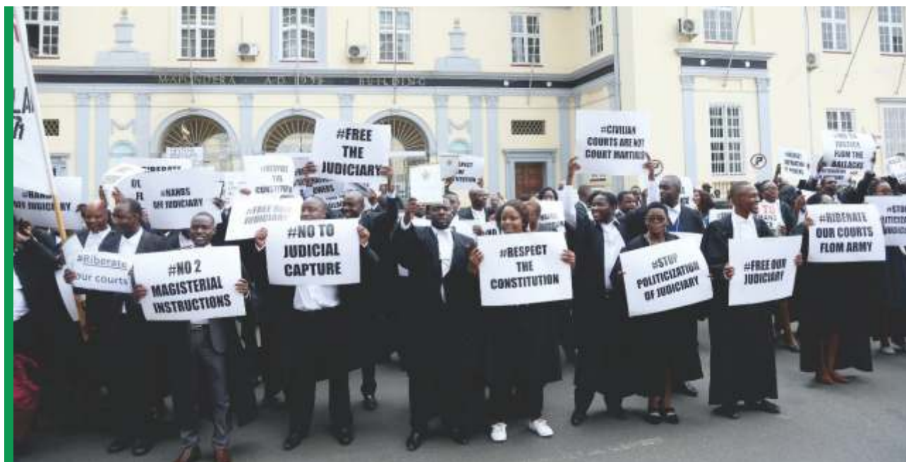
Zimbabwean lawyers show placards during a demonstration at the High Court of Zimbabwe on 29 January 2019 against irregularities in the handling of public violence cases in Magistrates Courts

minors were all removed from remand, and the State was to proceed by way of summons. The minors were released into the custody of their guardians. All children that were removed from remand and where the State was to proceed by way of summons have not been prosecuted to date. While there is no indication as yet as to whether the State will prosecute these children, the chance that the children would at some point be prosecuted remains.