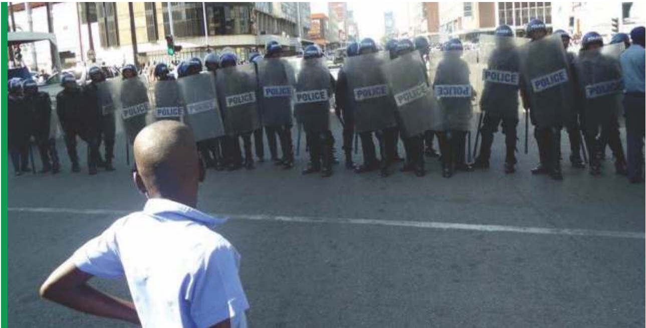
A child watches as Riot Police block the road

The police during bail hearings in Chitungwiza admitted that they had arrested primary school children, some as young as 11 years, although these were later released at the police stations. 41 In another case, Sky News reported that a number of children were randomly arrested, reporting that a sixteen-year old (16) was grabbed from the house, beaten up and bundled into a police vehicle. 42